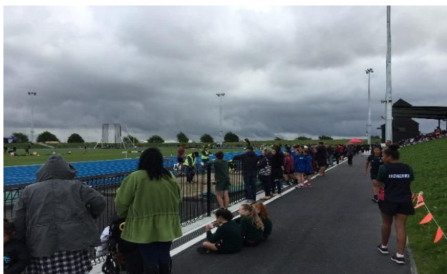
It was a cloudy and sometimes wet day at the new stadium. In saying that, the new facilities are fantastic.