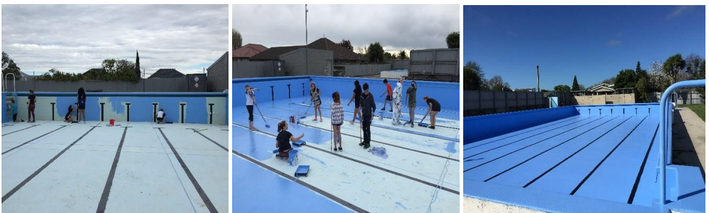
We have made a start.