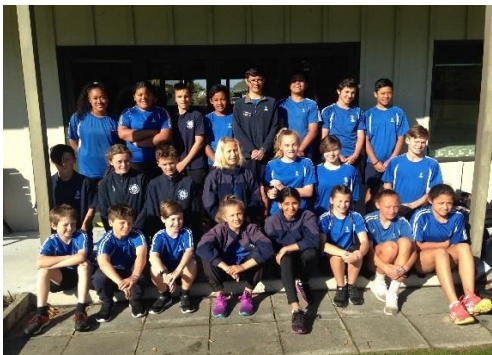
The team assembled in Ashburton all ready to go.