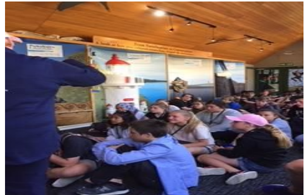
A group at the Albatross colony (picture taken today).