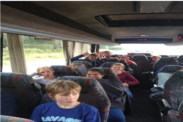
The Avon trip to Dunedin begins. Full steam ahead.

A reminder for Heathcote students that your camp is from Tuesday 5 December to Friday 8 December. If you still have any outstanding money left to pay then please sort this out with the office ladies as soon as possible. Many thanks.